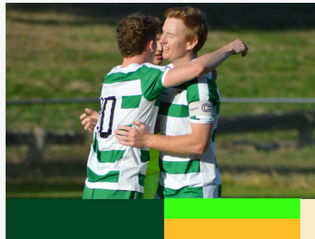
NPL Male: Primary - Forrest Green Secondary - Fluro Green, Wattle Yellow Accent - Cream