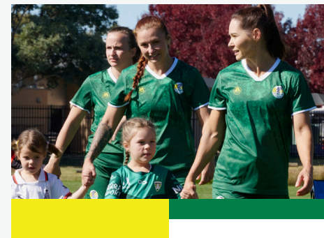
Community: Primary - OG Yellow Secondary - Bottle Green, White