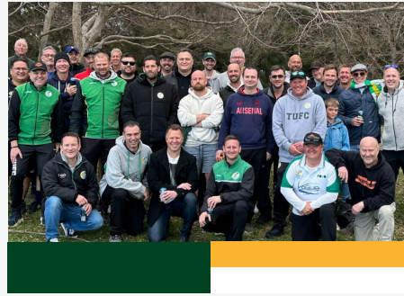
Club, Volunteers, Referees, etc Primary - Forrest Green Secondary - Wattle Gold, White

For logos, copy, corporate communication, web, and accents throughout collateral. The Forrest Green and Wattle Yellow should always be used with 100% tint.