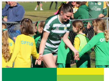
NPL Female: Primary - Bottle Green Secondary - OG Yellow, Citrus Green Accent - White