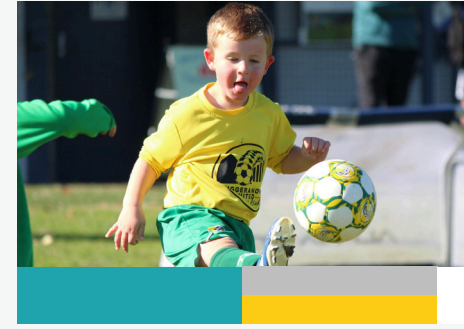
MiniRoos: Primary - Optus Teal Secondary - Silver, Wattle Yellow Accent - White