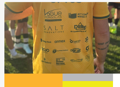
Sponsors: Primary - Wattle Yellow Secondary - Silver, OG Yellow Accent - White